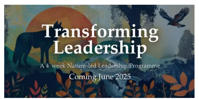
Weds 4th June, Thurs 12th June, Thurs 19th June, Thurs 26th June, 4 - 6pm BST

The Transforming Leadership Programme is a four-week (4x 2 hour) online course for education leaders to delve into the roots of our nested crises and explore our role in enabling healthier futures. This nature-led leadership programme is designed to support you to grow resilience as a leader and strengthen practical experience alongside a community of peers on a journey of transformation, together.