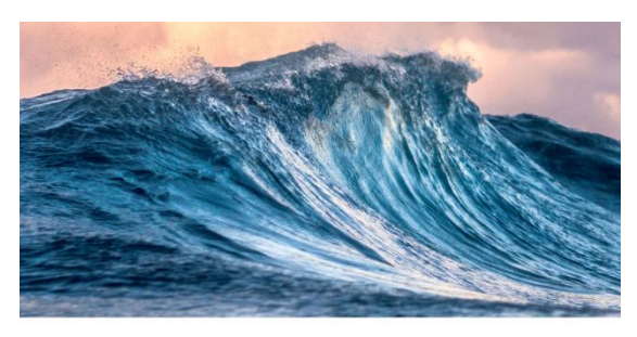
CLIMATE SOLUTIONS AT WORK

Climate Solutions at Work, presented by Drawdown Labs, is a how-to guide for employees looking to make every job a climate job.